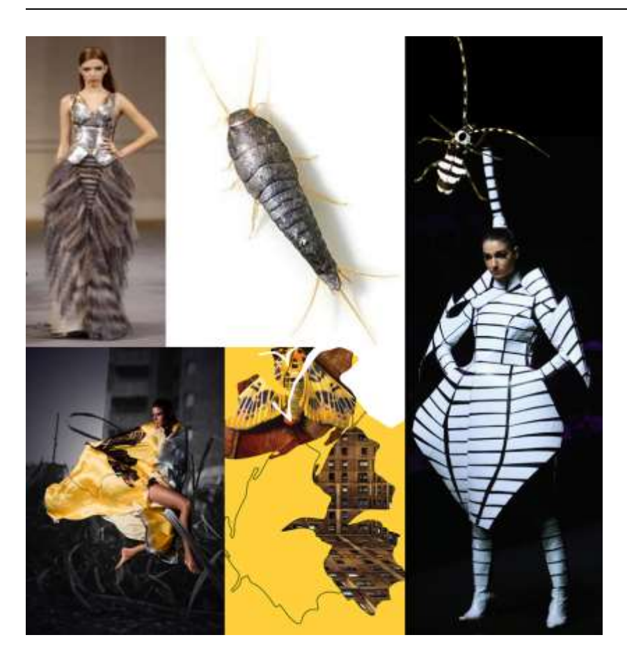
Object Design Examples